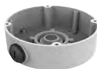
TC-P54BM Spec: V3 Junction Box