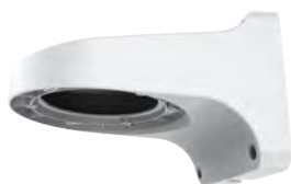
A28 Wall Mount